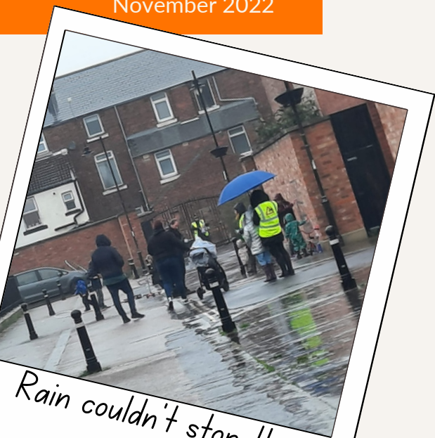
Rain couldn't stop the fun!

The first Play Streets session hosted by residents of Thornton Street and supported by the Vic Ward Partnership and Sarah Parker's Play Out Hartlepool. This enabled residents to close down the street for a few hours to allow children time to safely play outdoors while they manage traffic that needs to access the roads. This months event was attended by 30 kids aged 2-12, who, despite the rain had a great time! With council permission and general consensus from neighbours, residents legally close the road to through-traffic, using 'Road Closed' signs and cones, or other barriers such as wheelie-bins. Residents still have vehicle access and can leave their cars parked on the road. It is hoped that this scheme will continue throughout the town as a resident-led way of getting children playing outdoors safely.