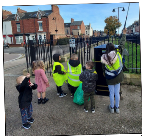
Great work keeping the parks tidy